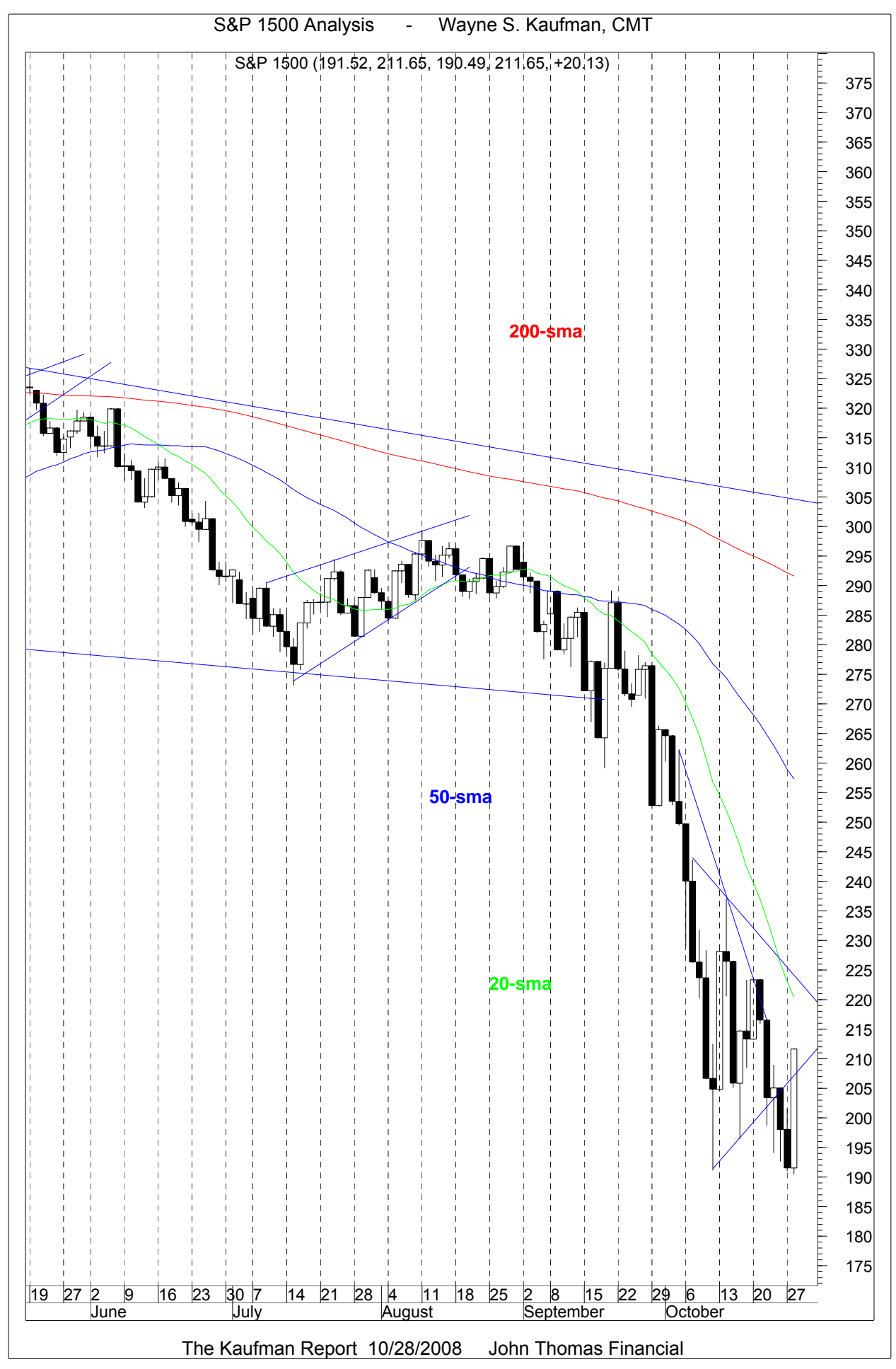
The S&P 1500 printed a bullish engulfing candle on Tuesday in what was a 90% up day similar to the one on 10/13.